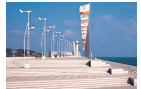
Aside from beaches, Qingdao has some of the finest yachting in China and provided a popular location for the sailing events of the 2008 Olympic Games Beijing.