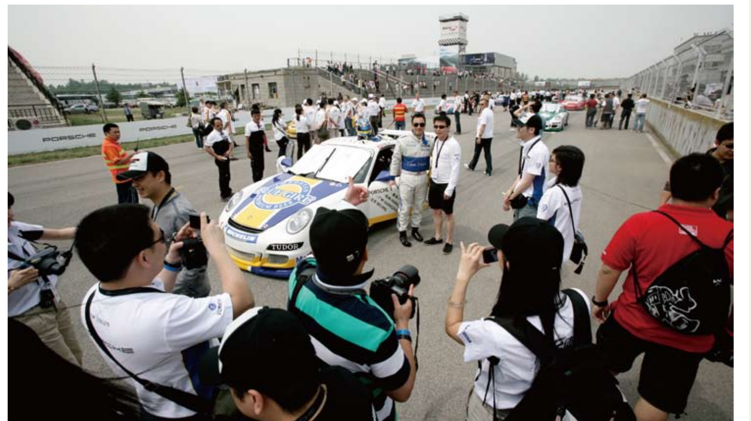
Fascination Porsche offered unprecedented access to the Pit Lane and Race Track, before and after each round of the Porsche Carrera Cup Asia.