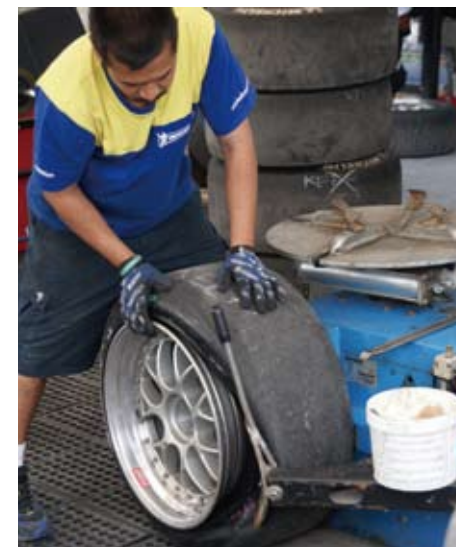
For every round of qualification or Carrera Cup racing, each GT3 Cup car needs a new set of Michelin racing tyres.

The highlight of the Porsche Carrera Cup Asia is not simply the speed and intensity of competition. The Porsche Carrera Cup puts fans in the midst of elite motorsport competition – offering a privileged insight into all that makes Porsche the world's greatest motorsport marque.