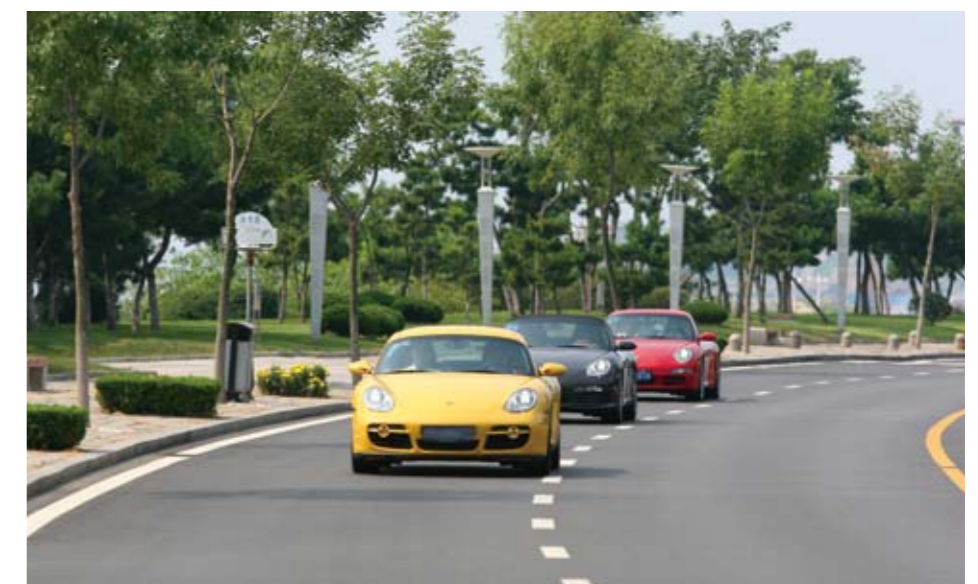
Since 2005, Qingdao has been a popular Porsche location, with superb driving opportunities and the annual Auto Qingdao.

Since the opening of the first Porsche Centre in Qingdao in 2005, the people of this acclaimed coastal city have long found their region ideal for the pleasures of Porsche driving. Porsche is delighted to pay tribute to the great history of Qingdao, and looks forward to sharing in its glittering future. ◀