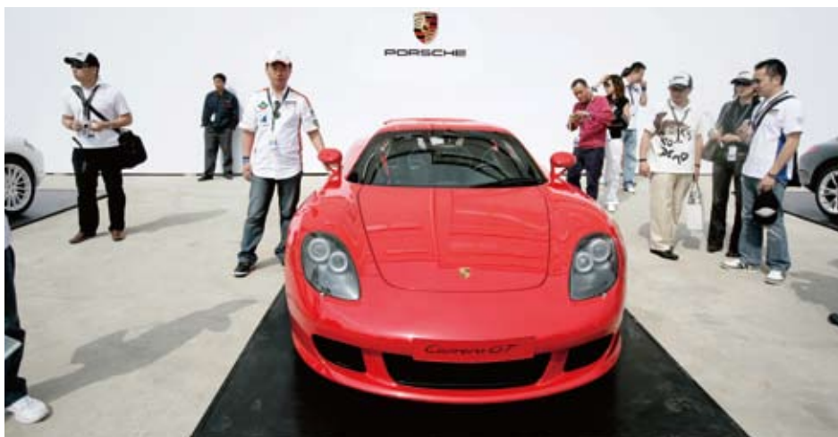
The Carrera GT provided an attraction for sports car lovers throughout the day.

911 Turbo, or race against friends in a computer simulation of the Porsche Cayman on the Beijing Goldenport Circuit.