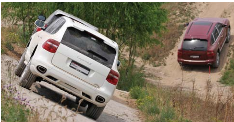
The Porsche Cayenne has been an ongoing favourite of the Chinese people and the off-road driving experience proved a leading attraction.