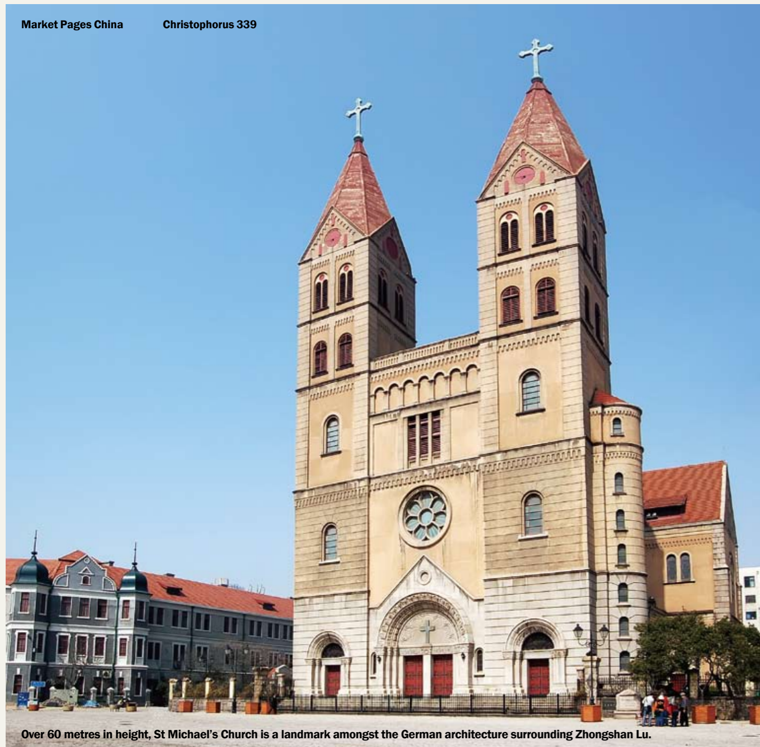
Over 60 metres in height, St Michael's Church is a landmark amongst the German architecture surrounding Zhongshan Lu.