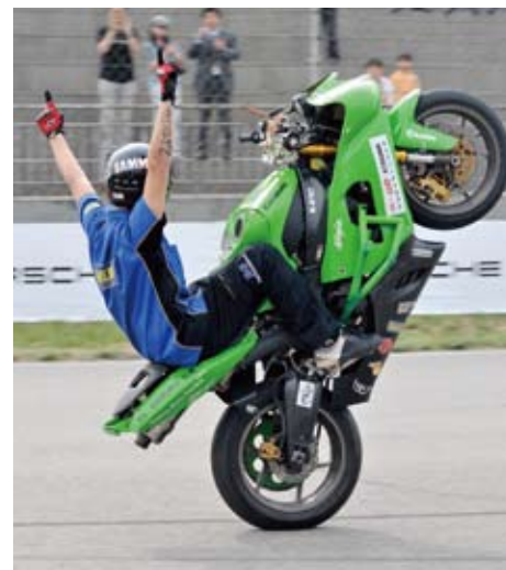
Along with rounds of the Carrera Cup, there was no shortage of entertainment for Porsche guests.

Adding to the impressive selection were further tributes to the celebrated culture of performance and innovation at Porsche. Other recent worldwide debutants, the Porsche Cayenne Design Edition 3 and Porsche Cayenne Transsyberia, captivated onlookers with their entirely unique model designs. Enhancing the display of Cayenne highlights was the presence of one of the 500 Porsche Cayenne Edition Style models, exclusively available in Mainland China only. Drawing special attention in front of the VIP hospitality area was yet another stunning car. With a carbon-fibre chassis perfectly polished in a marvellous Guards Red, a Porsche Carrera GT drew the adulation of the crowd all day long.