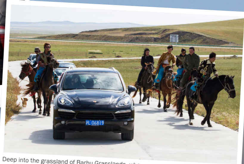
Deep into the grassland of Barhu Grasslands, where guests savour the joy on horseback under the guidance of local guide.