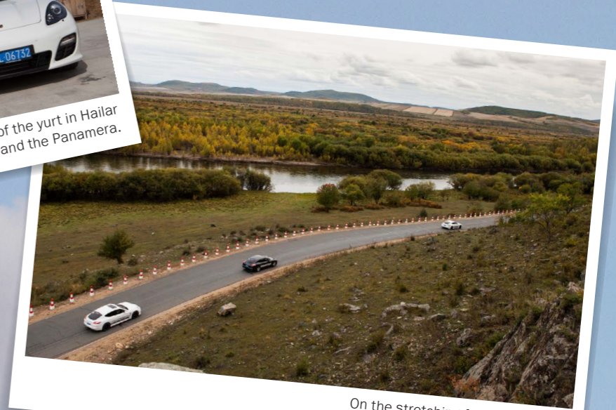
On the stretching freeway through the Genhe Wetland lake.