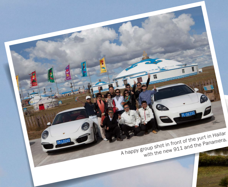
A happy group shot in front of the yurt in Hailar with the new 911 and the Panamera.