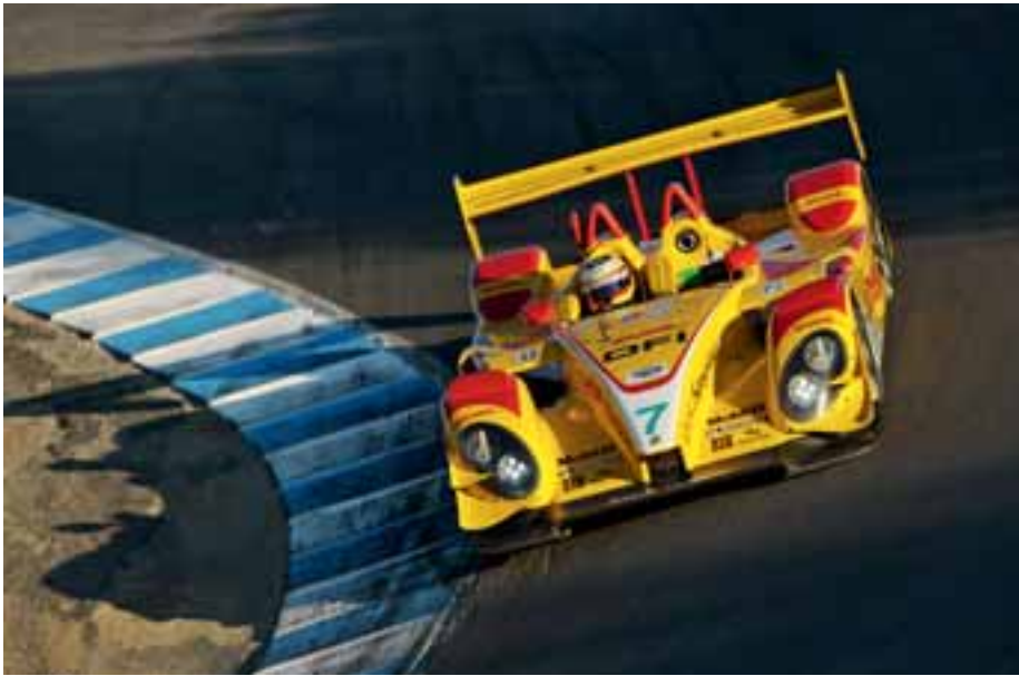
The RS Spyder set new standards in the LMP2 category